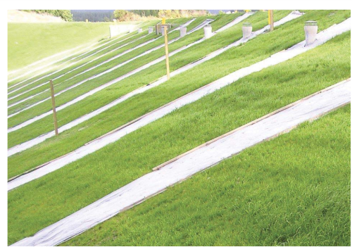
Dam Wall Growth