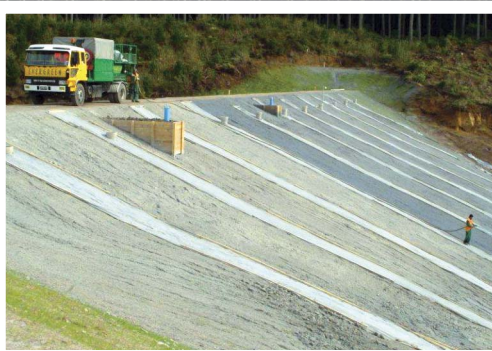
Dam Wall Application