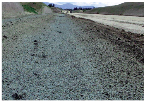
Swale Drain Application

Slip zones that are likely to have concentrated run-off during the establishment period, fretting soils in cut batters, soft or sandy embankments, water table restoration and out of growing season protection are all examples of when Bioblanket can provide additional protection while vegetation is being established.