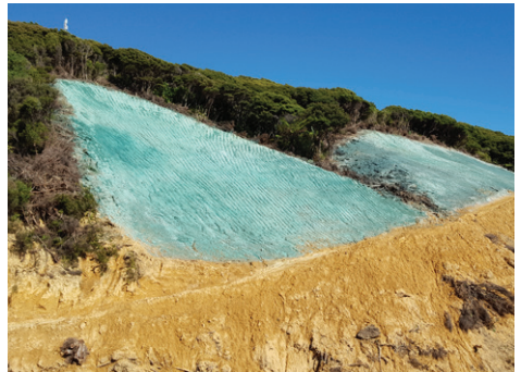
Hydroskin application and seeding helps with regenerating slip damage.